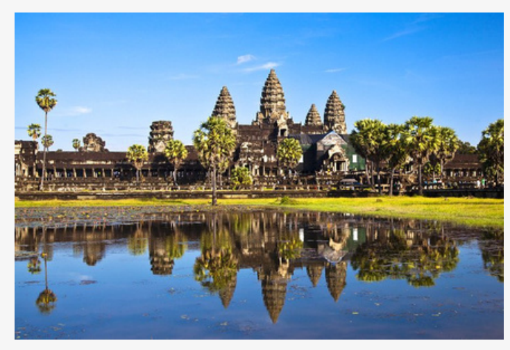
LKR 275,000/- Per Person