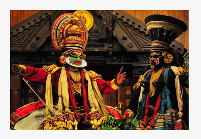
LKR 125,000/- Per Person on a Double Sharing Basis

VALID ONLY TILL THE 31ST OF OCTOBER 2023